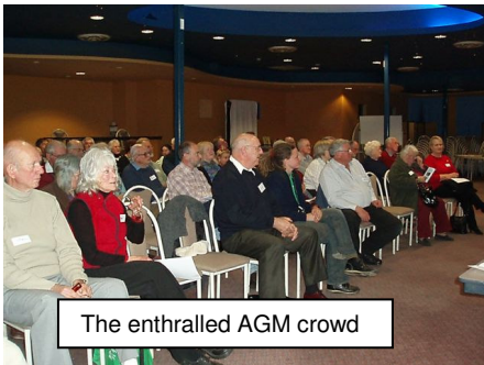
The enthralled AGM crowd

CIMAG had another very successful AGM and Public Information Night back in late August. Over 60 people attended and heard an update on CIMAG activities over the past year and the state of our finances (you can catch up on this from the President's 2007-08 Report on our website – www.indianmynaaction.org.au ). The highlights of the night were the presentations by