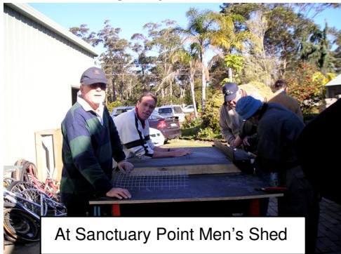
At Sanctuary Point Men's Shed