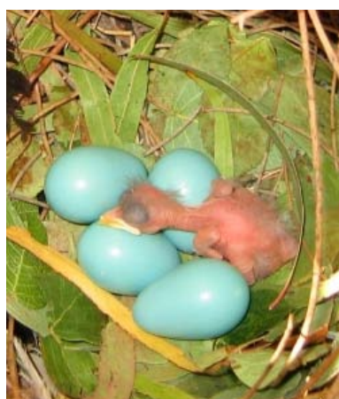
Common myna eggs and chick in a nestbox (above) and Crimson Rosella (below) using a nest box.

Culls of at least 25 birds per km 2 per year are needed or alternative methods for controlling this species will be required 7 (this cull rate relates to the Canberra study and population). The common myna