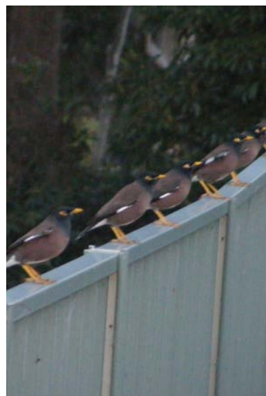
Common mynas.

Case Study on the impacts on common (Indian) mynas on other bird species and the effectiveness of community trapping in Canberra