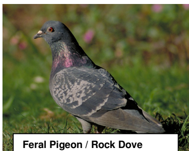
Feral Pigeon / Rock Dove