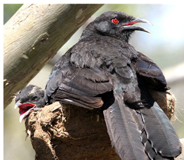
White-winged Chough on mud nest