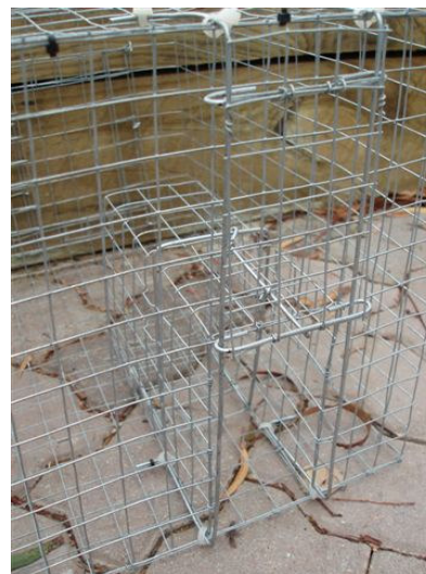
The Tiny Tim